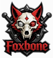
Resin green longan dice set